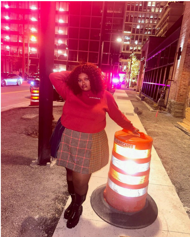
Exhibit B: The Plaid Mini Skirt Ensemble

The classic checks, a nod to timeless style, take on a fresh twist, exuding a youthful spirit that captures attention. Paired with sultry fishnet tights, this look embraces an unexpected contrast - delicacy meets edge, weaving a story of bold individuality.