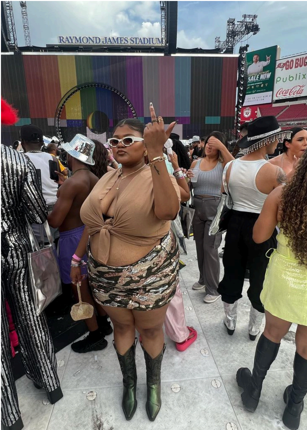
Fun Fact: These wicked green boots were DIY'd by Sydney herself.